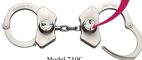
Model 710C Chain Link Handcuff