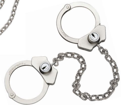
Model 703CHS Leg Iron