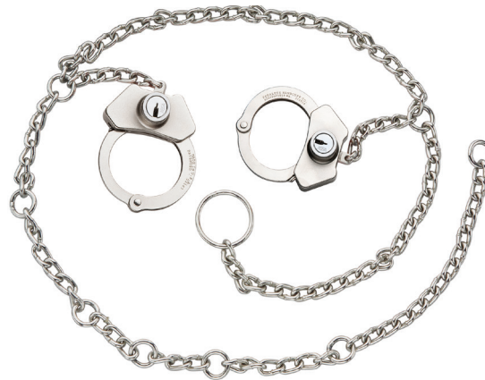
Model 7002CHS Waist Chain with Separated Cuffs