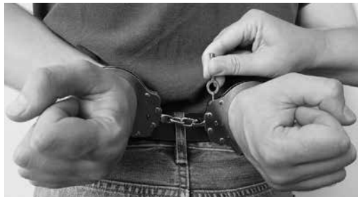
Double Lock Being Applied

Immediately double lock the handcuffs by inserting the tip of the key into the small hole on the side of the body of the handcuff. Press inward until it is possible to feel the double lock click into place. Repeat on the second cuff. Check to be sure both handcuffs are double locked by applying pressure to each of the single strands. If the single strands do not move, the handcuffs are double locked.