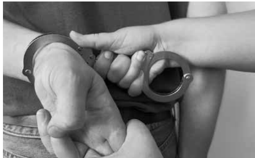
Single Cuff Being Applied

Place the single strand against the suspect's wrist between the base of the hand and the wrist (ulna) bone. Press the single strand firmly against the wrist causing it to swing through the double strand and reengage. Tighten the cuff, being careful not to pinch the skin, catch clothing, jewelry or other material.