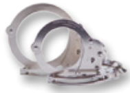
CHAIN LINK HANDCUFFS