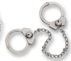
HIGH SECURITY RESTRAINTS