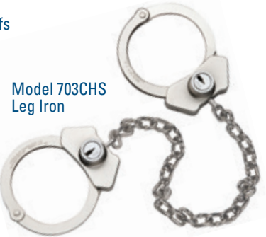
Model 703CHS Leg Iron