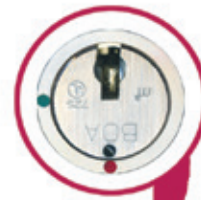
Model 710C Chain Link Handcuff