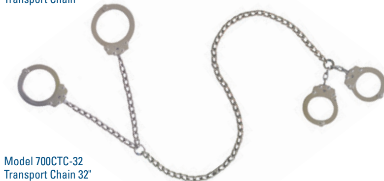
Model 700CTC-32 Transport Chain 32'

Peerless® works with you to provide exactly the products you need.