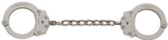
Model 700C-6X Extended Chain Link Handcuff

Peerless® offers restraints for special situations and custom chain work to meet specific requirements. These products are variations of standard models or use component parts from standard models in different configurations to create the right tool for the job. Custom restraints may be available with the high security lock option. Call 800-732-3705 to discuss how your special restraint needs can be met.